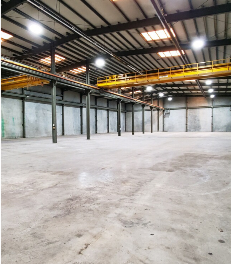
Seattle Industrial District Space