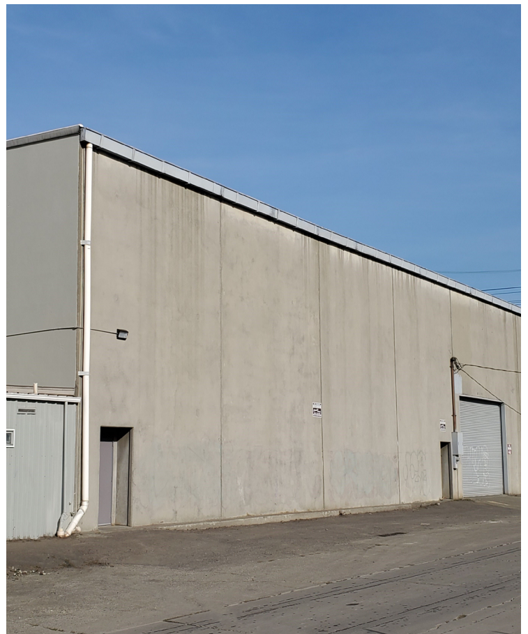
Open Entrance Area

Many new businesses nearby with a variety of other strong manufacturing, design, and service offerings