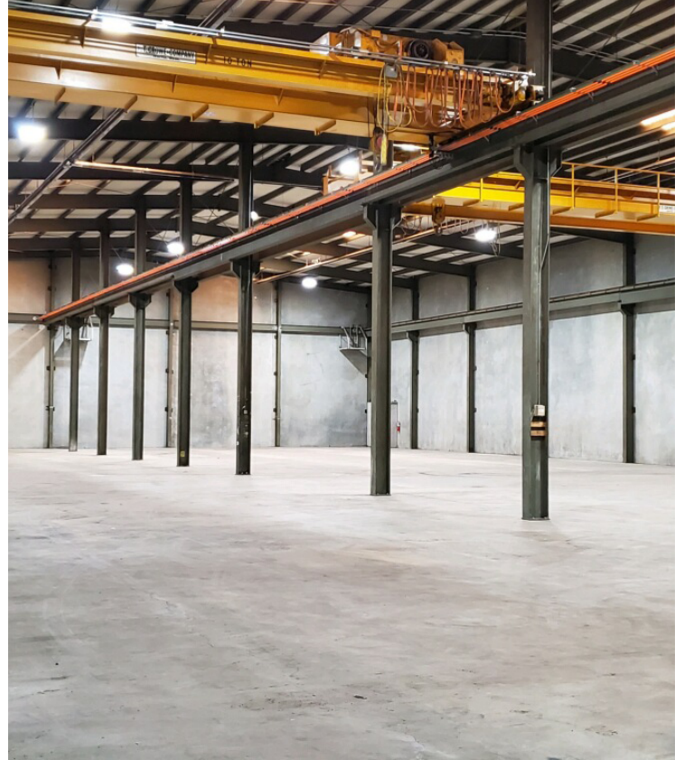
Open Design - 30' Clear Height