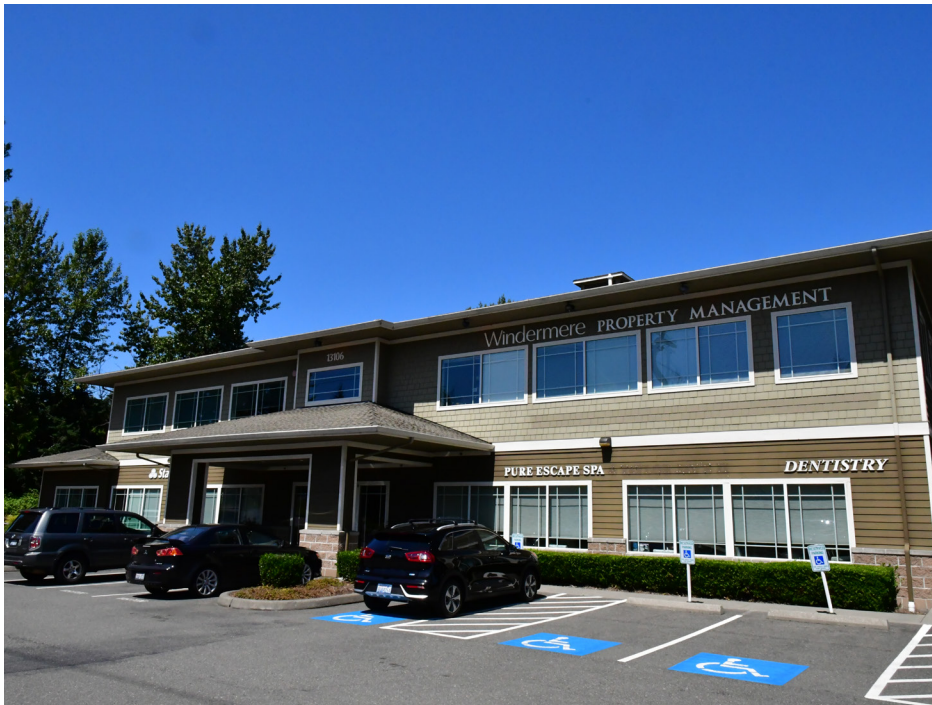
13106 SE 240 TH ST, KENT, WA 98031