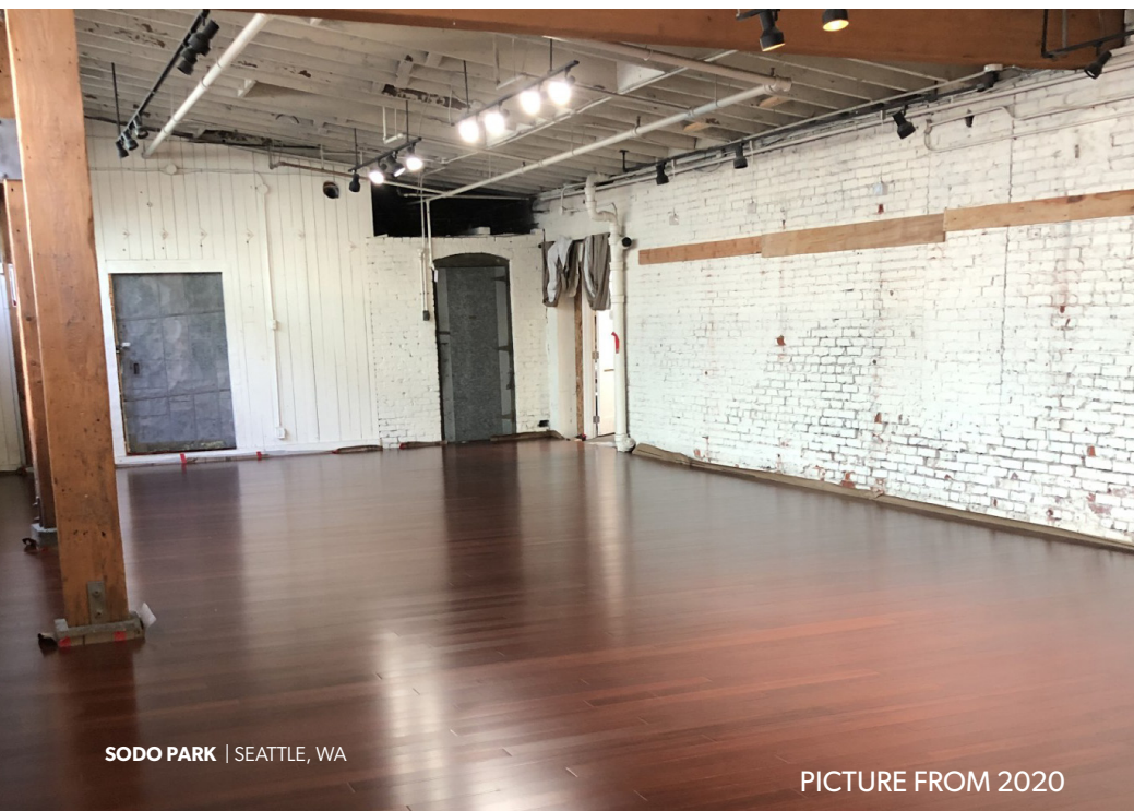
SODO PARK | SEATTLE, WA