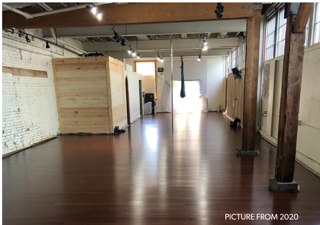
PICTURE FROM 2020